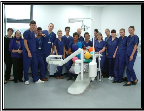
Year 5 Students at SBCH

Patient feedback has been excellent, which is very reassuring, and we continue to strive to deliver a high standard of patient care while giving the students a great learning experience.