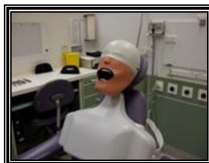
Oral Surgery Phantom Heads